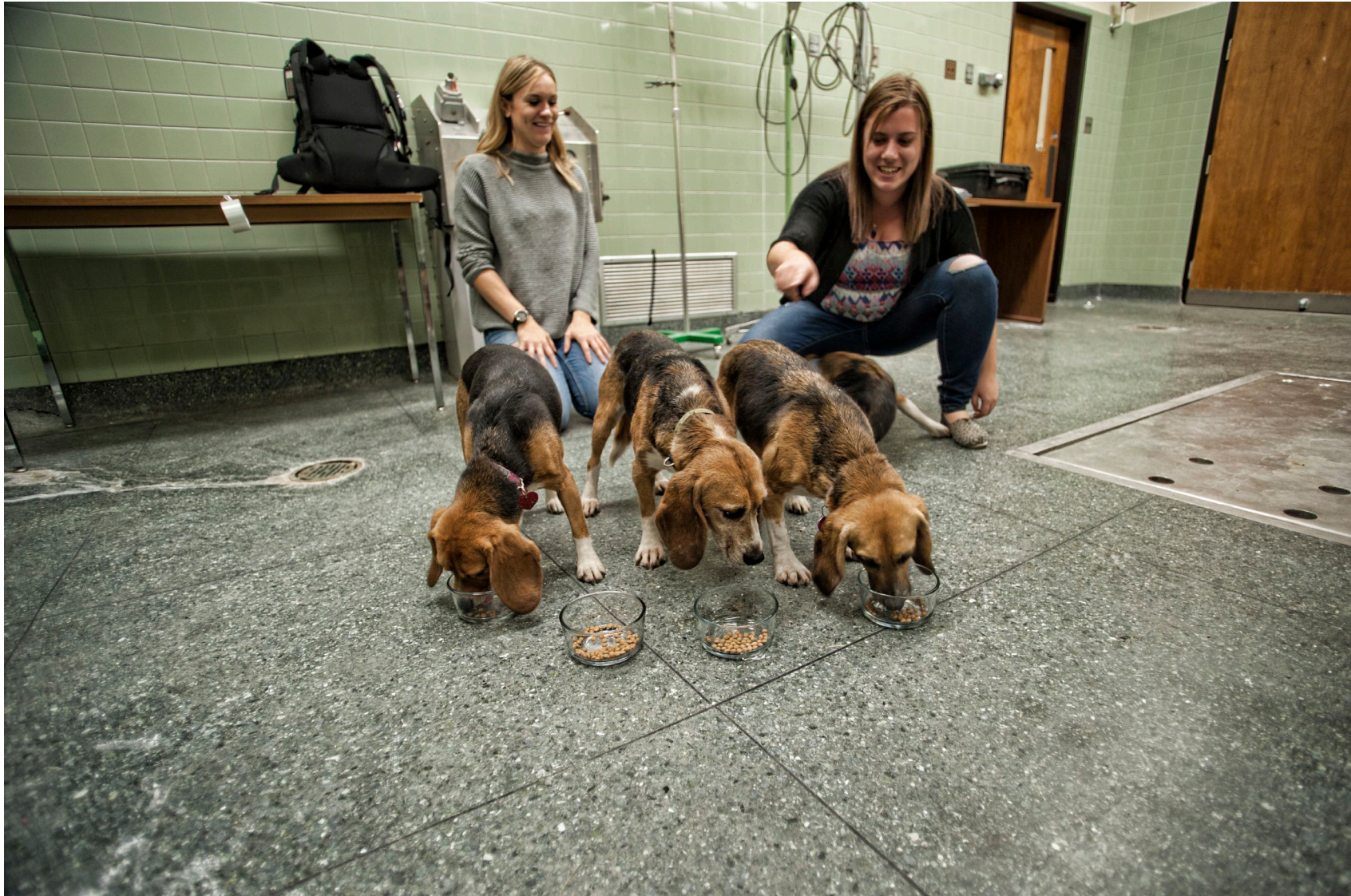
Grad students feeding the eager Beagles a variety of dog foods produced at the lab at the University of Saskatchewan.