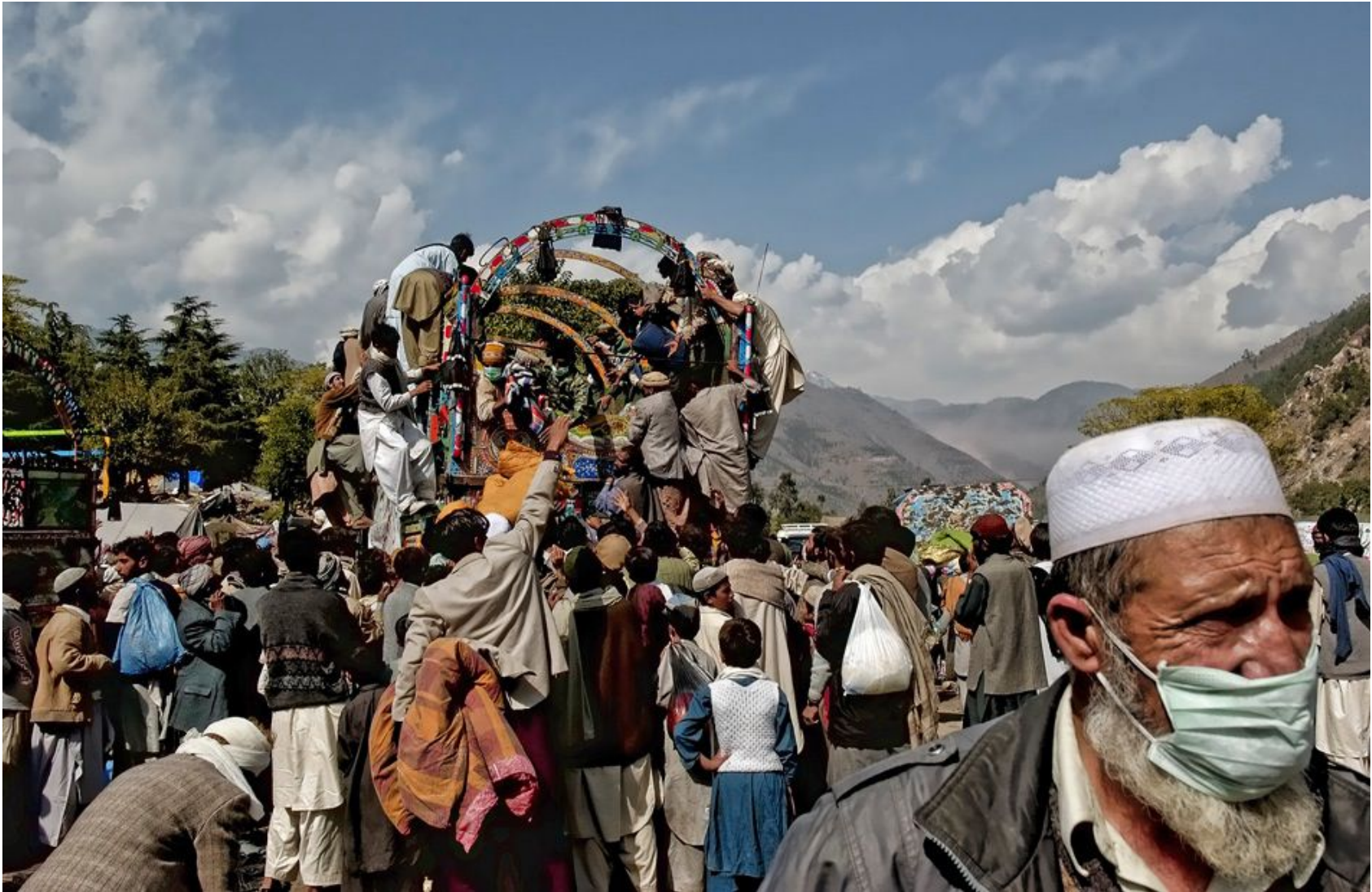
Earthquake effected Pakistani's clamour across a truck loaded with donated clothing.