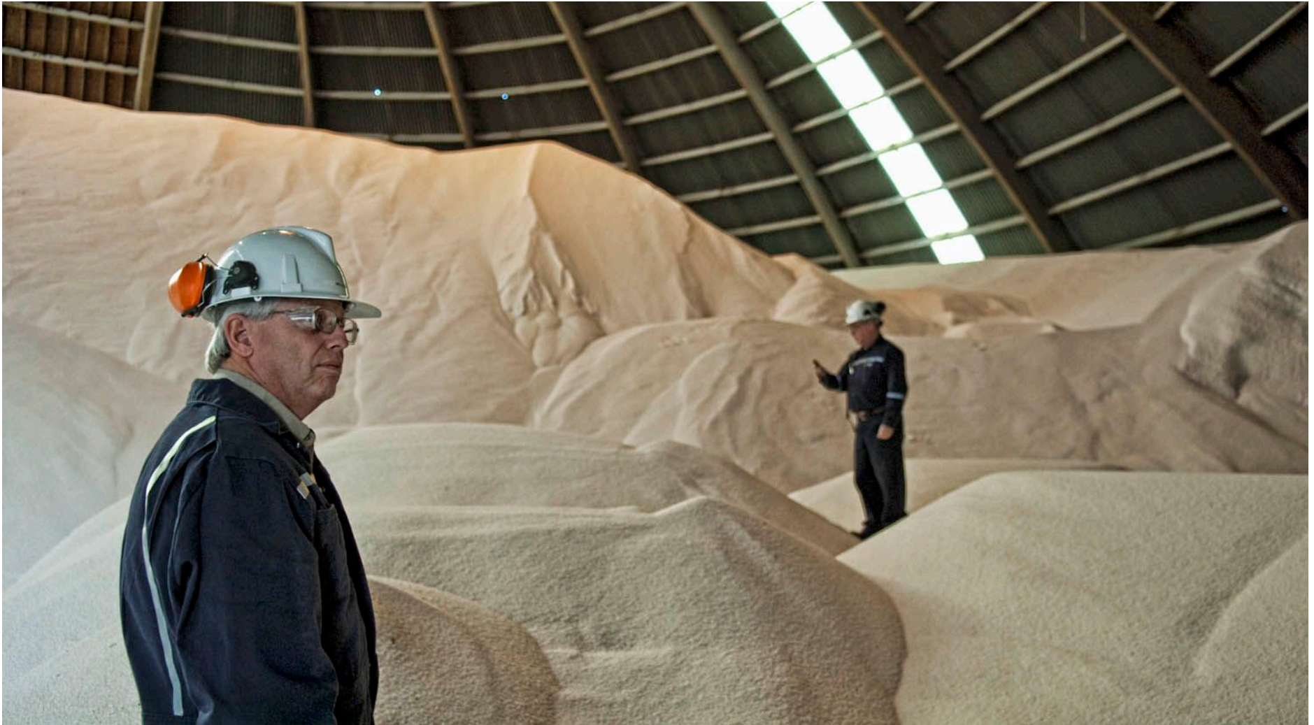
Workers inspect potash at Vittera's mine outside Saskatoon. SK.