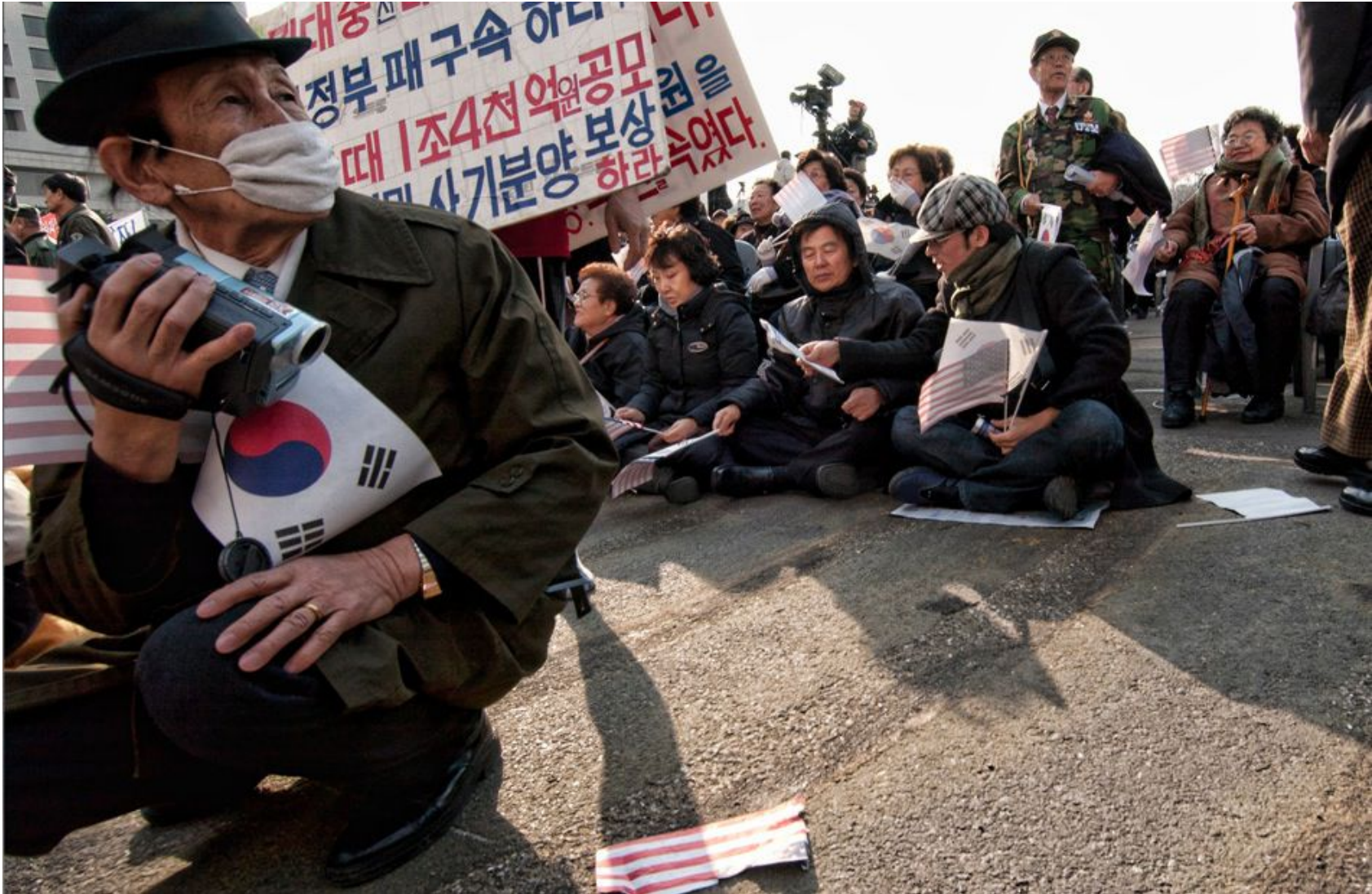
An elderly South Korean man video tapes the days proceedings of a pro American rally held in Seoul, South Korea.