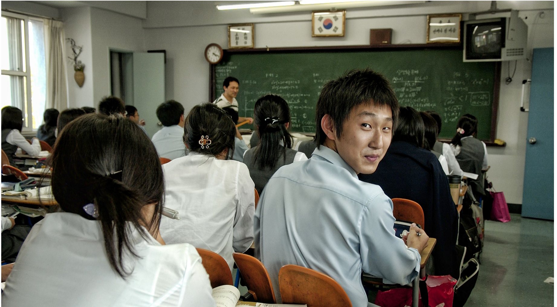
Students at the Seoul Foreign Language High School work on their algebra, Seoul, South Korea.